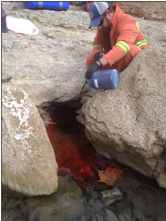
Figure 1. Dye injection into a recharge feature (swallet) within Onion Creek where surface water enters the subsurface through a small opening.