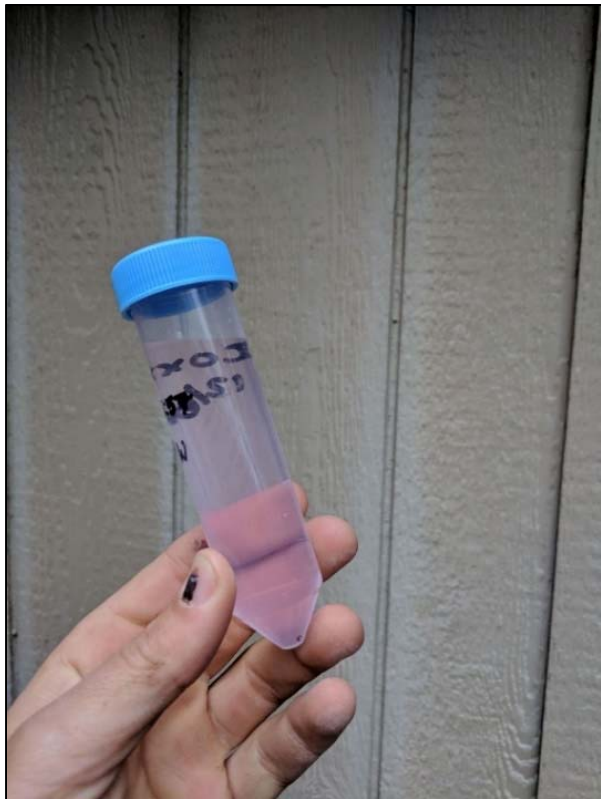
Figure 2. Water sample taken from a domestic Trinity well that showed a positive dye detection. The well is located about 1.25 miles downgradient from the injection site.