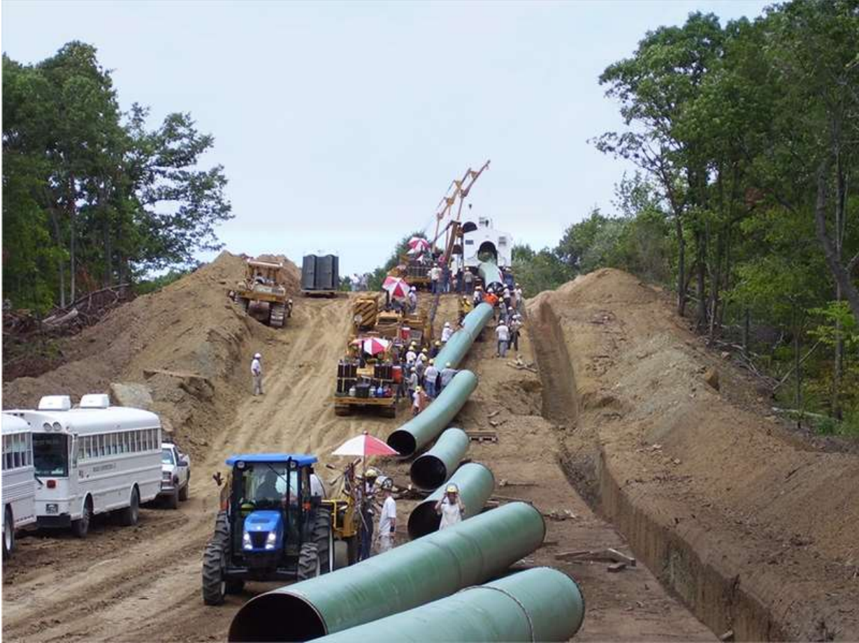
Figure 2: Photo of construction of a representative 42-inch pipeline in a 125-foot wide easement.