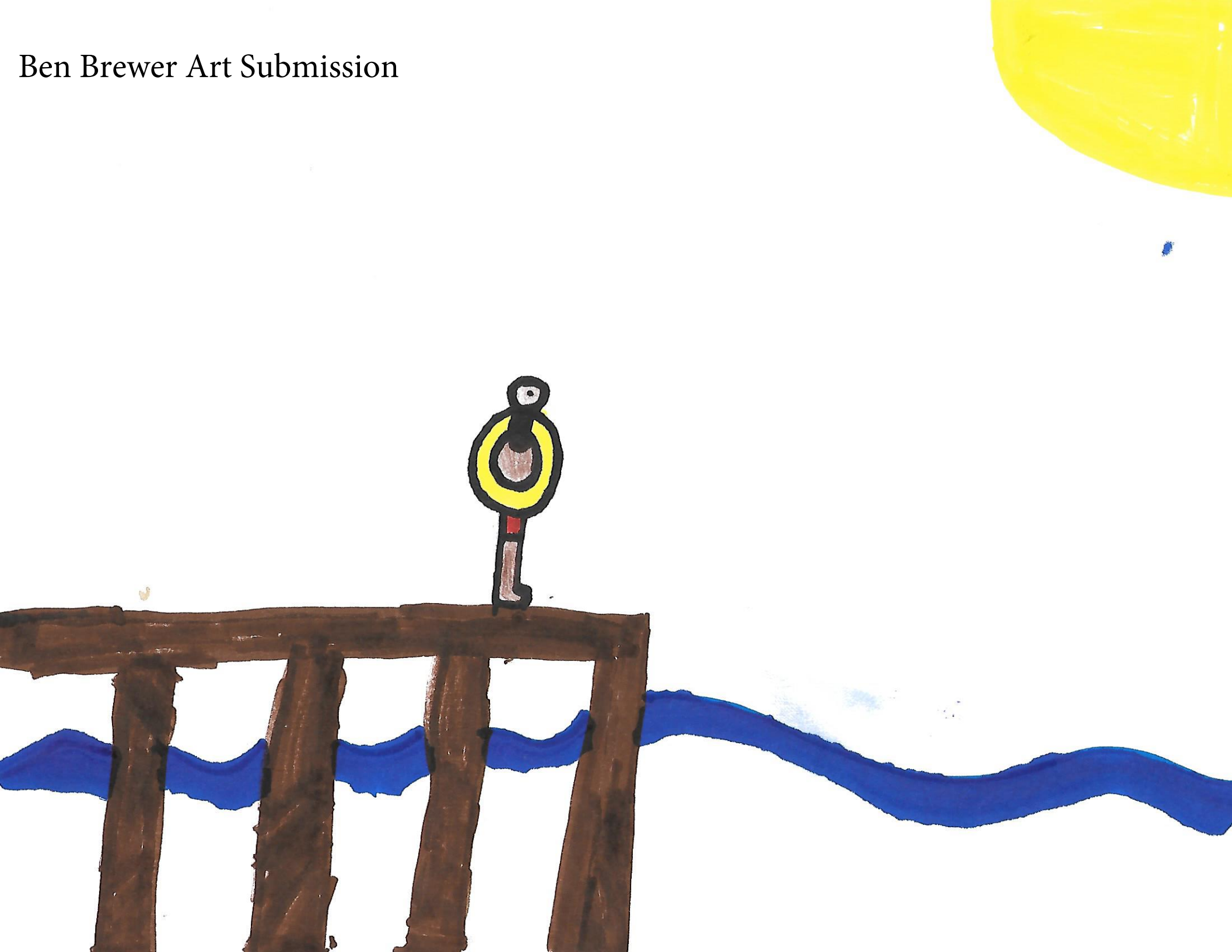
Ben Brewer Art Submission